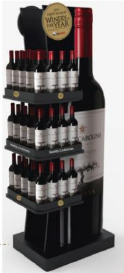
• Santa Carolina display