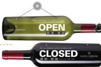
• Open/Closed signs for stores